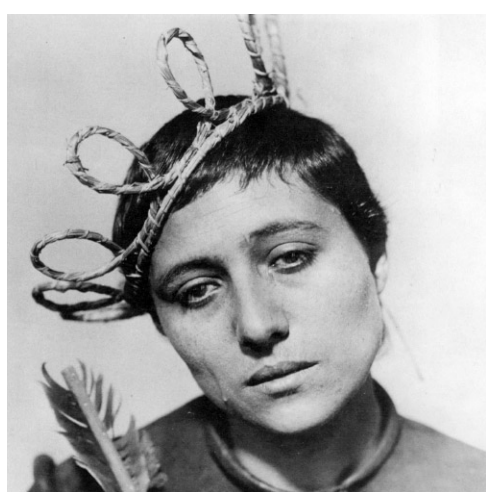
Maria Falconetti as Joan of Arc