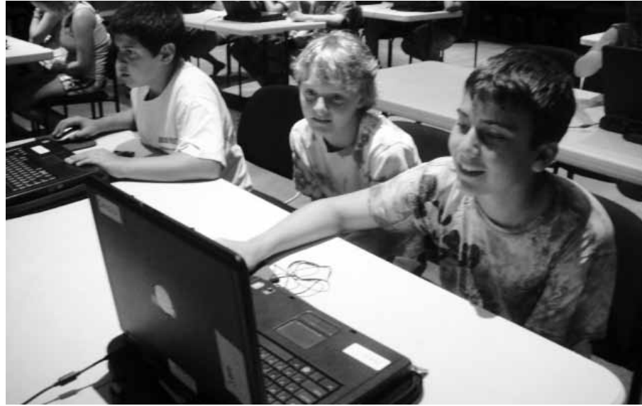
Last season's learn how to build your own video game event

Wii Wednesday Video Games. Wednesdays in September from 3:30 to 5 p.m., come and play your favorite video games and test our newest titles. No registration required.