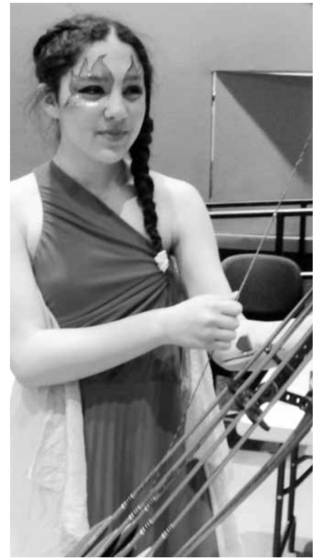
At last month's Hunger Games party